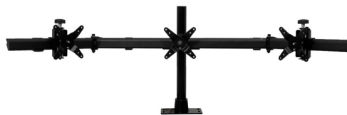
Flush Mount: 100-F16-B03-TW