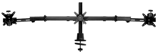
Grommet Mount: 100-G16-B03-TW