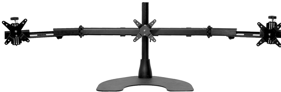
Desk Stand: 100-D16-B03-TW