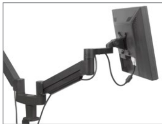
Includes integrated cable management