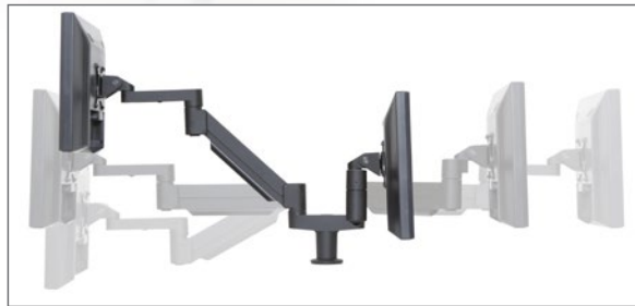
Quickly adjust monitor position as your needs change