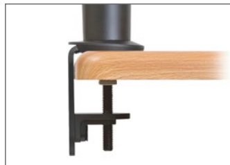
Clamps to desk edge or through

Now you can mount two of our best-selling 7Flex ® LCD Arms from one point on your desk. Effortlessly reposition each monitor with just one hand. You will free up desk space, even as you work in greater ergonomic comfort. The dual mount can be clamped to desk edge or grommet, or bolted through the desk.